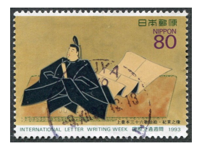
Write a letter to someone today, and put some good postage on it!!

The 1936 Ruttledge Expedition was notable for the nondelivery of its mail, sent from base camp to Gantok, Nepal, with a special cancel. The mystery of the "lost" mail was solved when the postmaster at Gantok was arrested and 494 Expedition covers were found in his possession. The few of these covers that exist today are very rare, and have a typed note stuck on the back of them, explaining that the postmaster was in jail for failing in his duty!